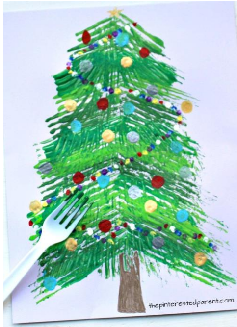
Christmas Tree Art!